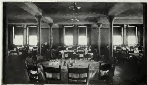
HEPBURN HALL DINING ROOM